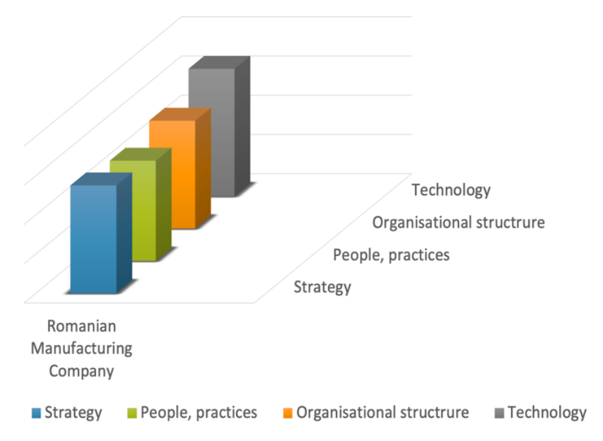
Figure 2. Manifested organisational agility